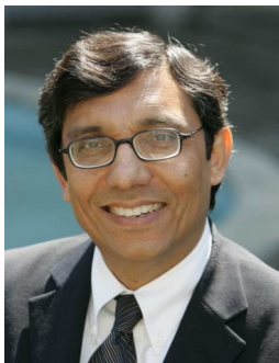
Dr. Zulfiqar Bhutta, 2013 Henderson Lecturer

The 30th Annual Department of Obstetrics and Gynaecology Research Day will be held on FRIDAY, MAY 10, 2013 , at the Old Vic Building, at 91 Charles St. West in Victoria University in the University of Toronto . This event brings together members of the department, while showcasing the breadth and depth of its research, as presented by its many trainees.