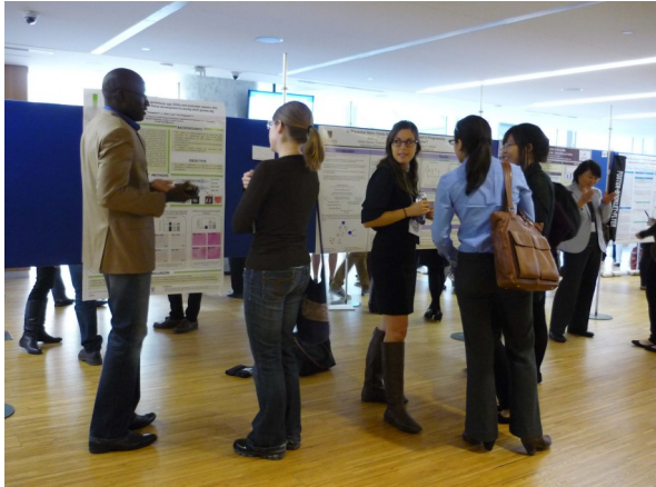
Attendees browse the posters at EC-PIM at the Keenan Research Centre at St. Michael's Hospital