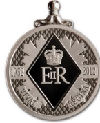
Queen Elizabeth II Diamond Jubilee Medal