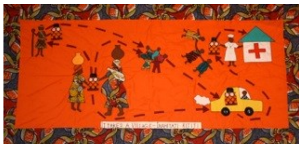
"It takes a village" quilt