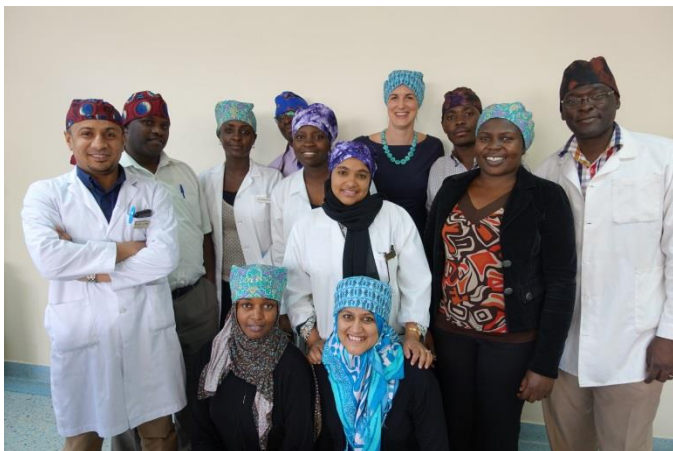
With a group of Registrars in June 2016.

long-term, we'd like this clinic space to become a "Centre of Excellence" for adolescent health care, training and research (the 3 prongs of the AMPATH mission).