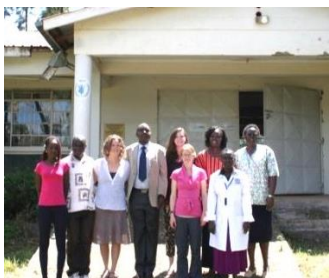
Some of our Peer Navigators and other clinic staff in front of the building allocated to the Adolescent Clinic (pre-renovation!)