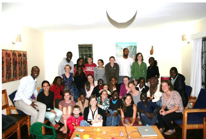
Launch party for GlobalGiving.org Adolescent Clinic fundraiser (April 2016)

It also includes 100 street children and youth. To be able to conduct ethical research with street children, we felt it necessary to leverage our original clinic infrastructure to provide at least first aid and referrals to MTRH as needed.