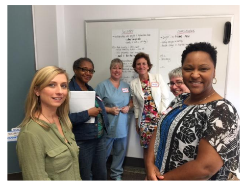
Members of SOON attending simulation day and workshop on PPH facilitated by MORE OB

Flush with success of our common protocol for gestational diabetes, we embarked on an ambitious project for tackling postpartum hemorrhage within our Network.